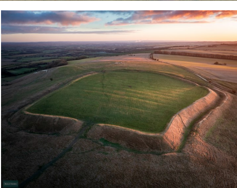
Above left: West Kennet Long Barrow and Silbury Hill Above right: White Horse Hill Left : Uffington Castle