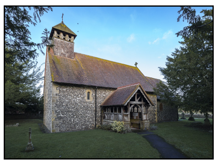
...but drier at St Mary's, Upton.