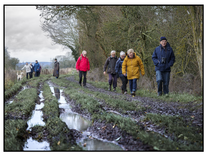
Slightly damp under foot...