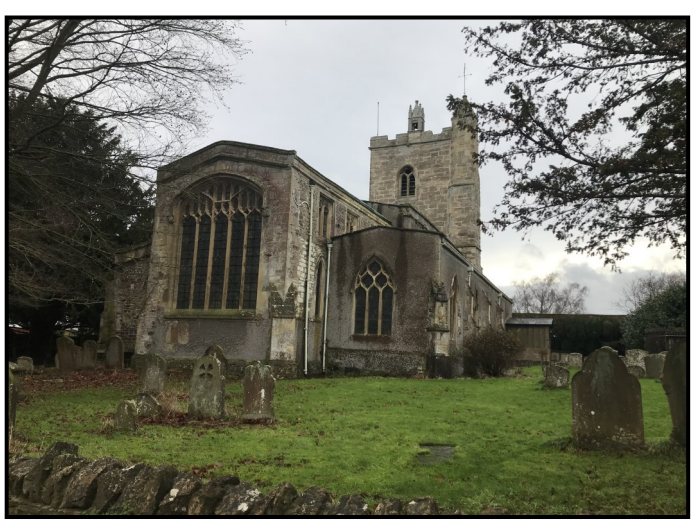
...to visit Saint Andrew's Church.