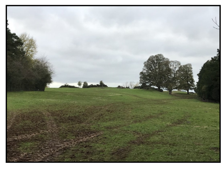
Remains of the Iron Age 'fort'?