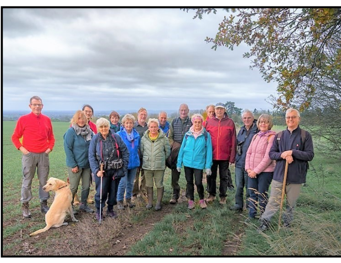
...our intrepid group of walkers.