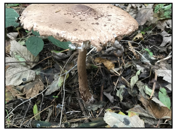
"Don't worry. It is not poisonous!?"