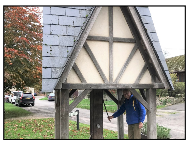
Vaughan trying out the village pump!