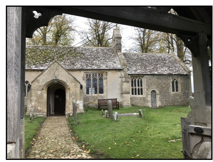
St Mary's at Little Coxwell.