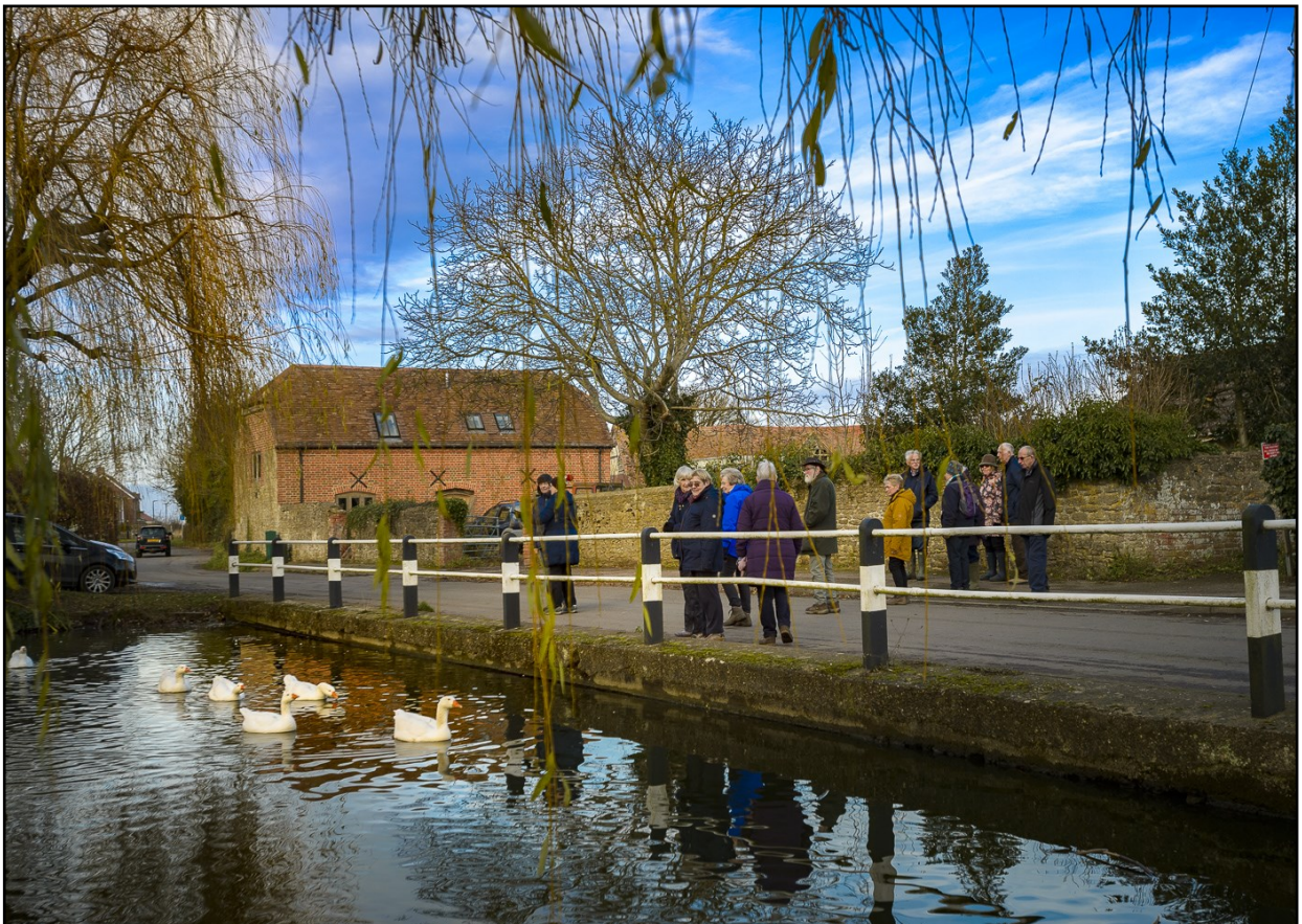
Thanks \ to \ Bartle \ Frere \ for \ the \ photographs \ above \ and \ also \ the \ two \ aerial \ views \ on \ the \ cover.