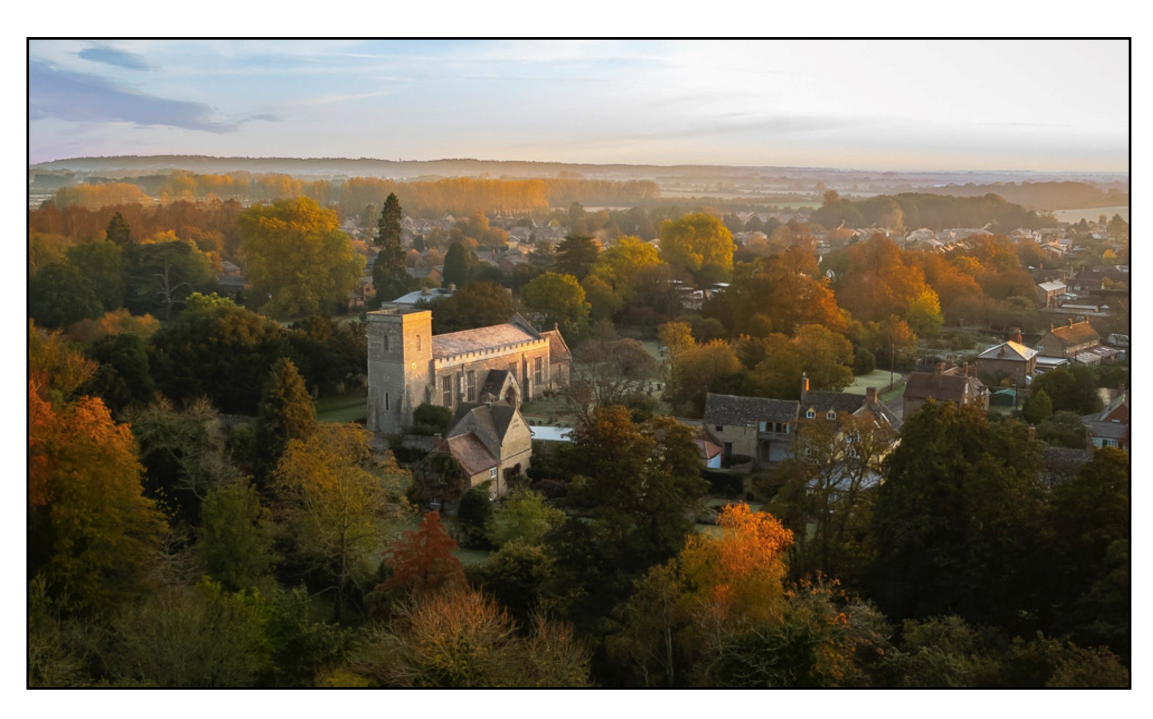
Happy New Year 2022