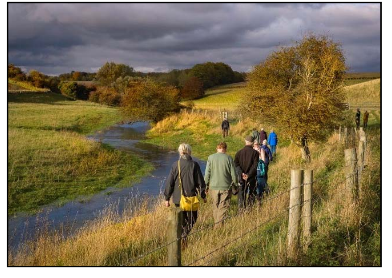
{\it Many thanks to Bartle Frere for the photographs-more are online, available upon request!}