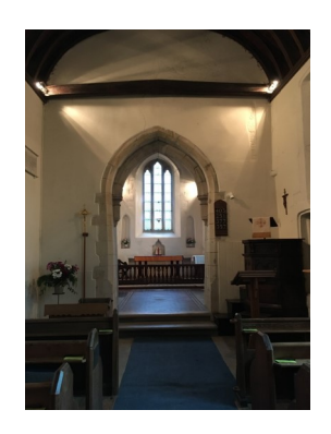
The walkers then visited the Great Coxwell Church of St Giles. For details: <a href="http://www.faringdon.org/st-giles-church.html">http://www.faringdon.org/st-giles-church.html</a>