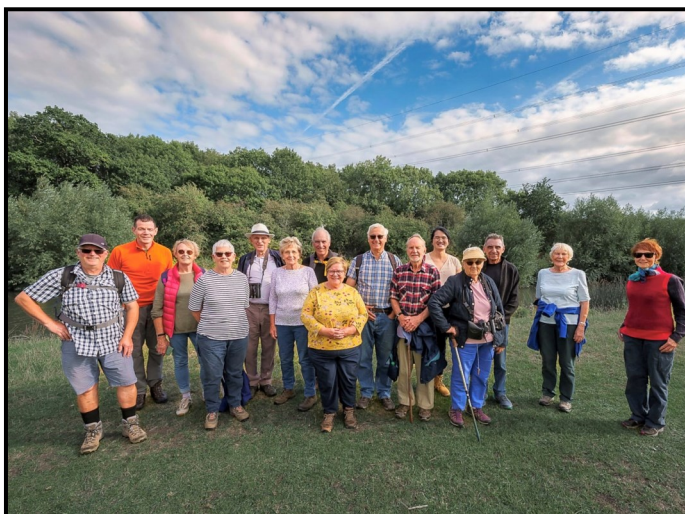
Bartle's group photograph en route.