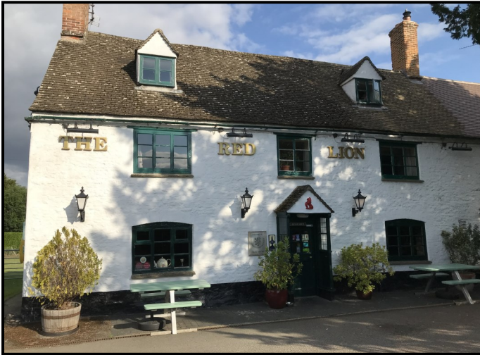
The Red Lion for lunch first...