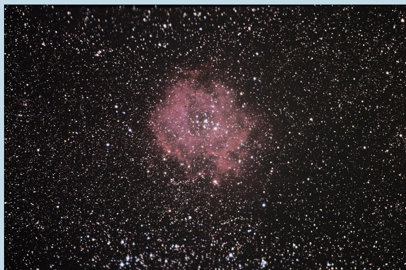
Rosette Nebula: 5,200 light years away (3178 BC)

He explained how long it had taken for the light to arrive from distance stars and he also put this into a historic context - the light for some images dating back to the time of the Egyptian pharaohs or even the Sumerian civilisation!