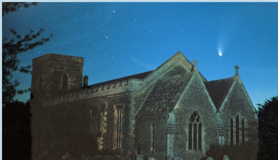
Comet Hale-Bopp over Marcham Church