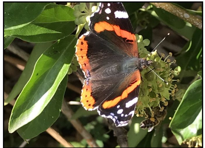
...a Red Admiral ( Vanessa Atalanta ).