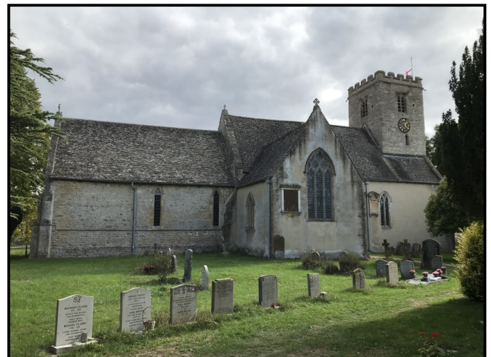
Finally a visit to Northmoor Church.