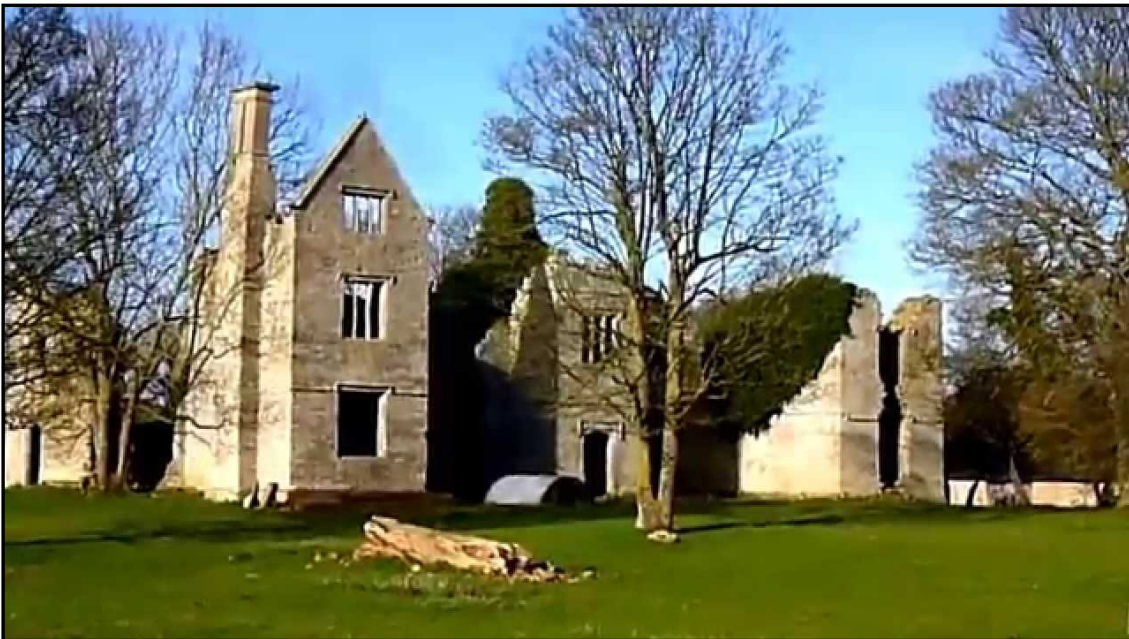
One of the many examples: Hampton Gay - a village that has totally disappeared leaving an isolated church and a ruined manor house.

She gave us many examples, working chronologically from Roman times through to the present day, hinting at the end of her talk that large infrastructural projects such as HS2 and airport expansions could well have a similar effect in future.