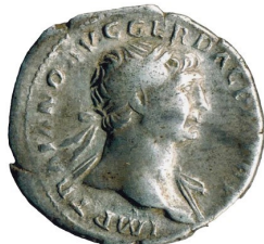
Silver denarius (dated to 106 AD) from Trajan's reign found at 'Trendles'

Sheila Dunford will begin with a talk on the content of the archives, describing some of the stories they uncover. This will be followed by an interval with drinks, wine, teas and coffees, and cake to enjoy whilst members can peruse some of the archives we hold. We have a collection of old Marcham photos, stories and letters, all showing the rich history of the village and the characters who used to live here.