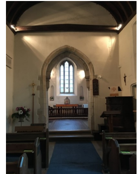
The walkers then visited the Great Coxwell Church of St Giles. For details: http://www.faringdon.org/st-giles-church.html